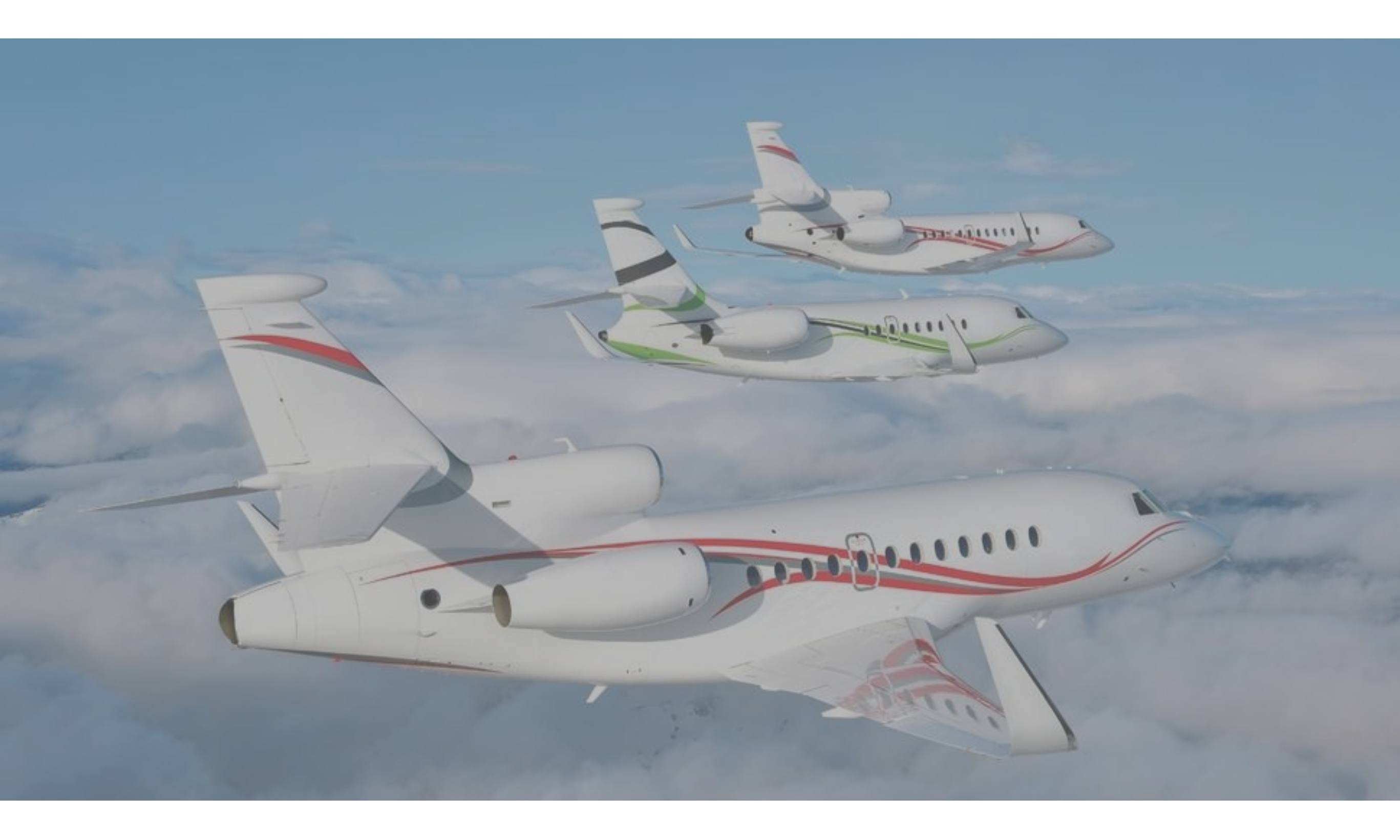
2010 DASSAULT FALCON 7X SPECIFICATIONS