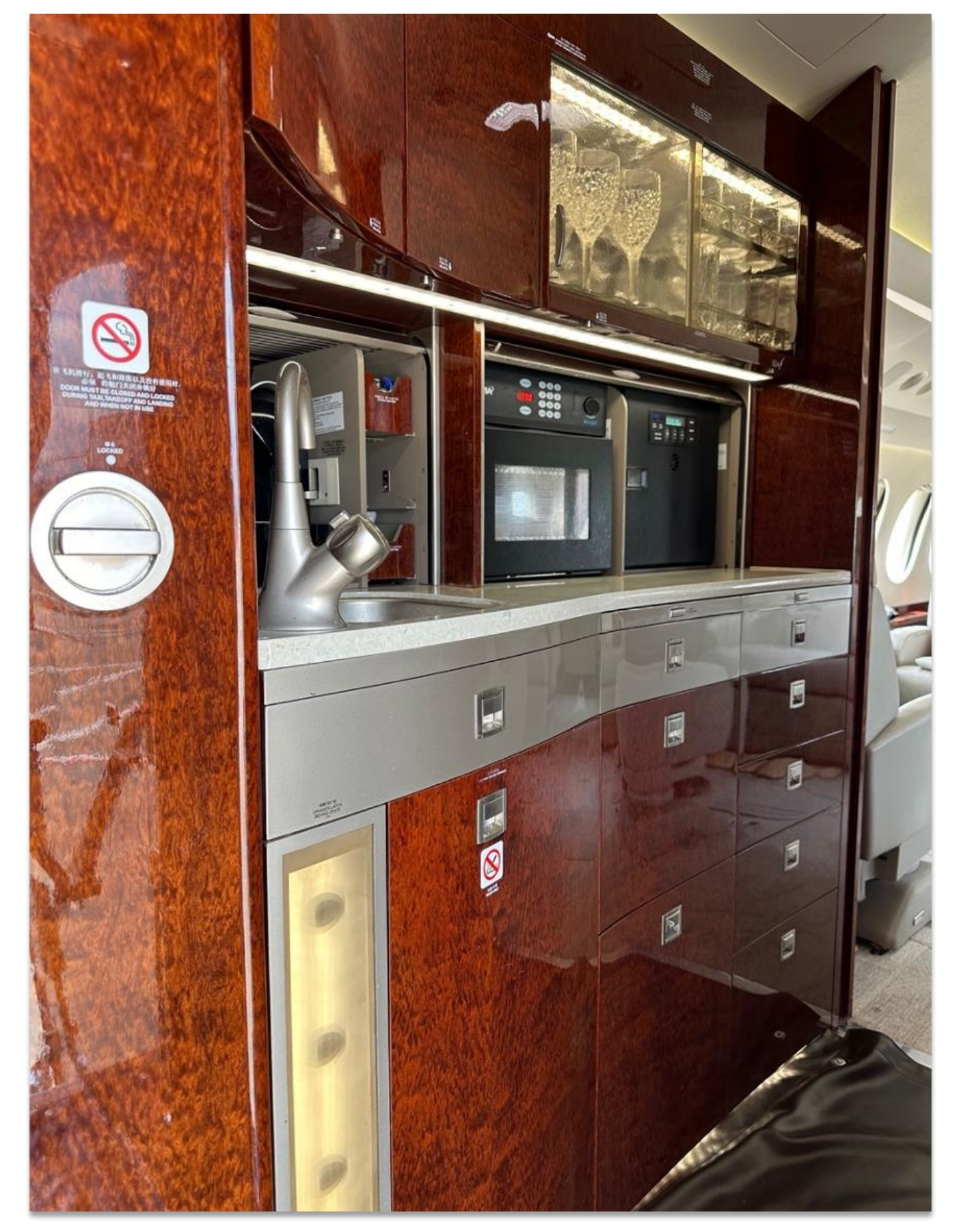
Aircraft specifications are subject to verification upon aircraft inspection by purchaser. Aircraft availability is subject to prior sale or withdrawal from the market without prior written notice.