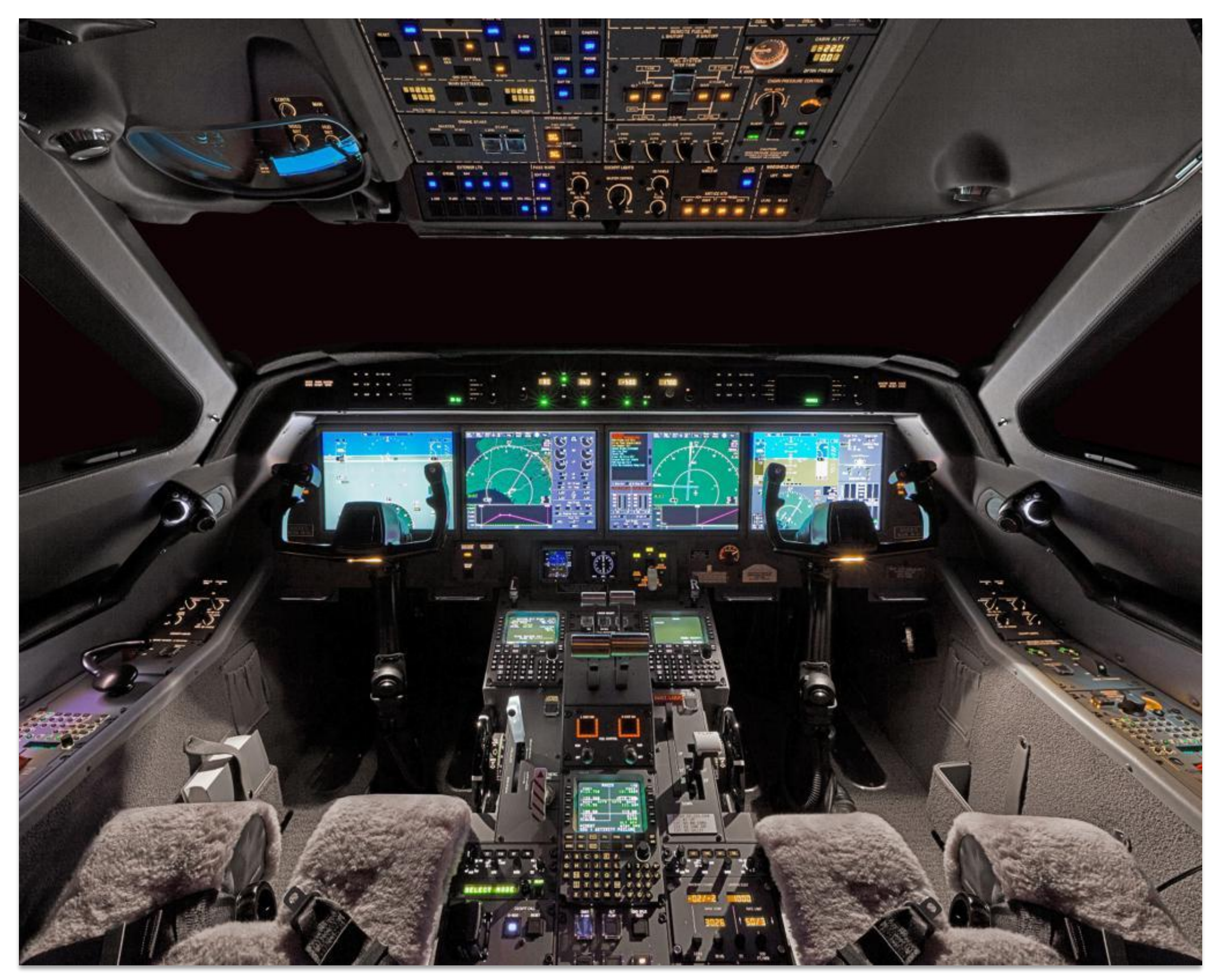
Aircraft specifications are subject to verification upon aircraft inspection by purchaser. Aircraft availability is subject to prior sale or withdrawal from the market without prior written notice.