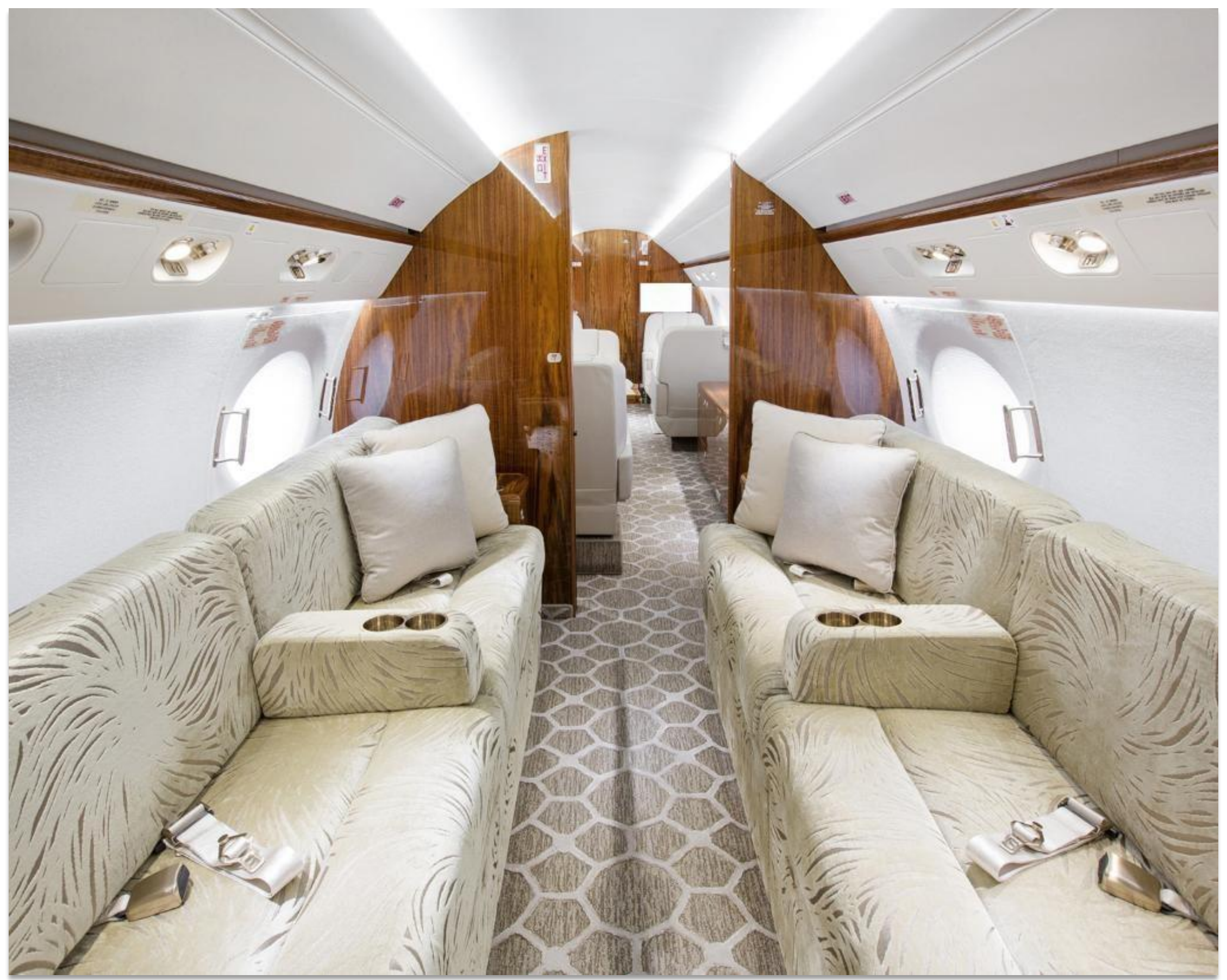
Aircraft specifications are subject to verification upon aircraft inspection by purchaser. Aircraft availability is subject to prior sale or withdrawal from the market without prior written notice.