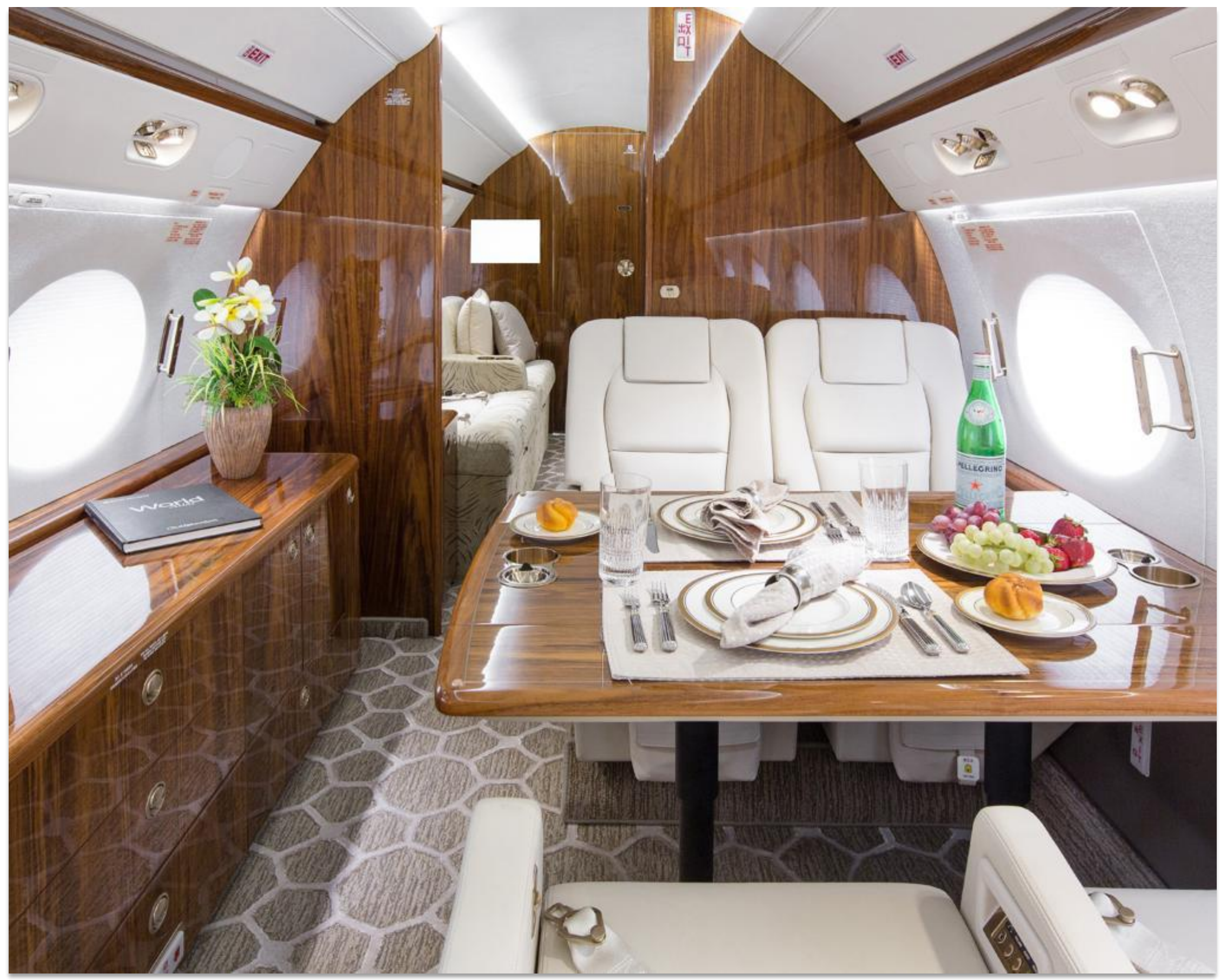
Aircraft specifications are subject to verification upon aircraft inspection by purchaser. Aircraft availability is subject to prior sale or withdrawal from the market without prior written notice.