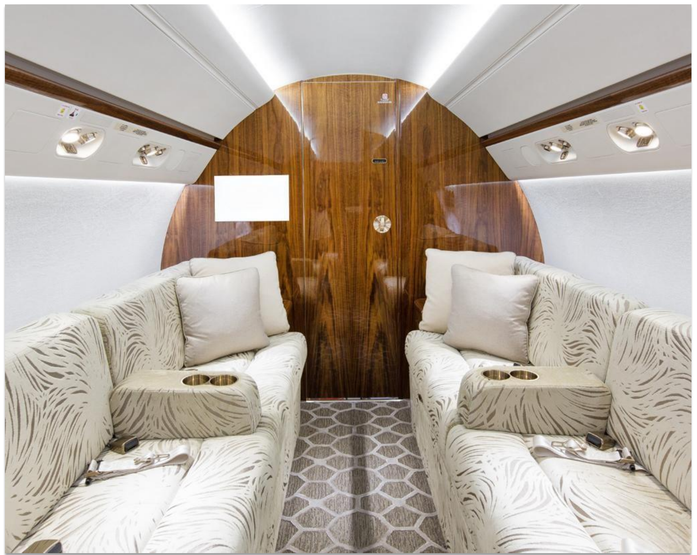
Aircraft specifications are subject to verification upon aircraft inspection by purchaser. Aircraft availability is subject to prior sale or withdrawal from the market without prior written notice.